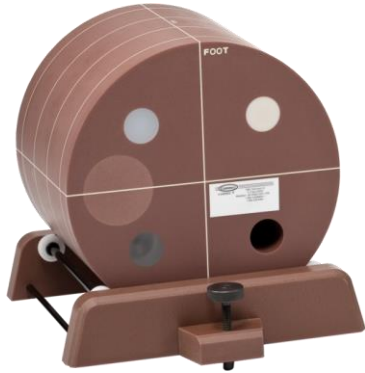
CT 464 Accreditation Phantom & Stand*