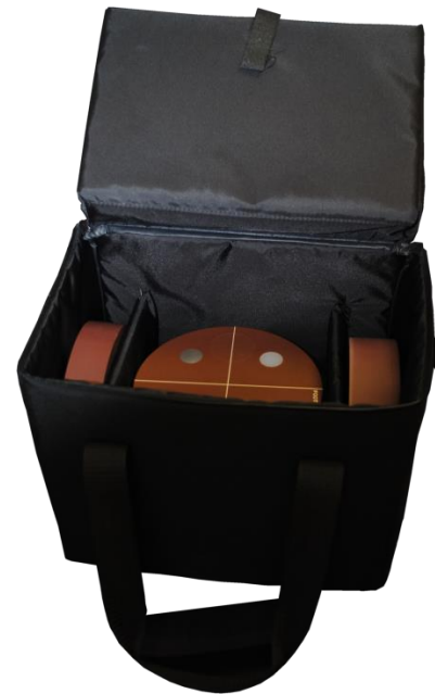
CT 464 Accreditation Phantom & Extension Plate Kit Soft Case*