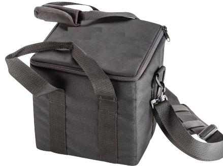
CT 464 Accreditation Phantom & Extension Plate Kit* (Kit includes large expandable stand and 2 extension plates)