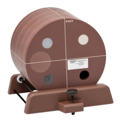
CT 464 Accreditation Phantom & Stand*